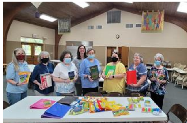
Theta members donated school supplies for South Side High School as their August service project. The Guidance counselors will issue these items to the students.