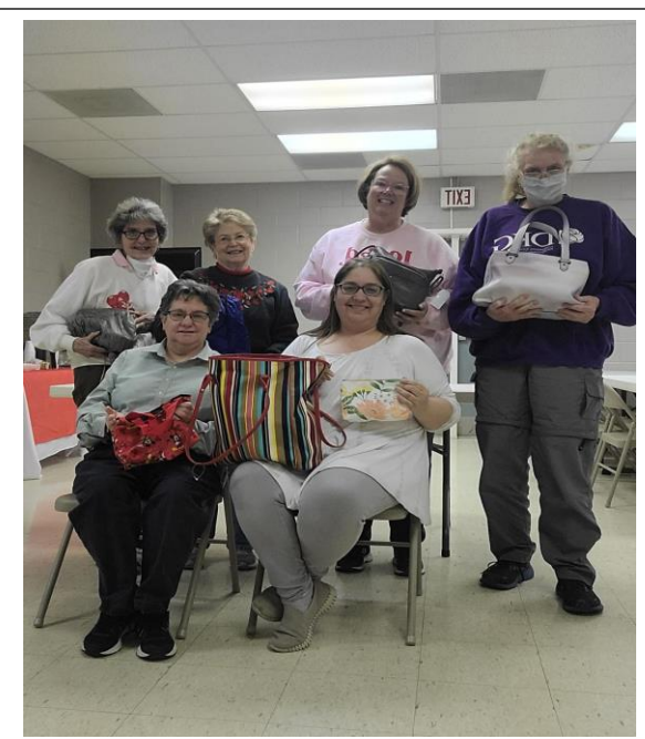
Theta members filled purses and donated the "Blessing Bags" for ladies at the Carl Perkins Cream Center for their March chapter activity.