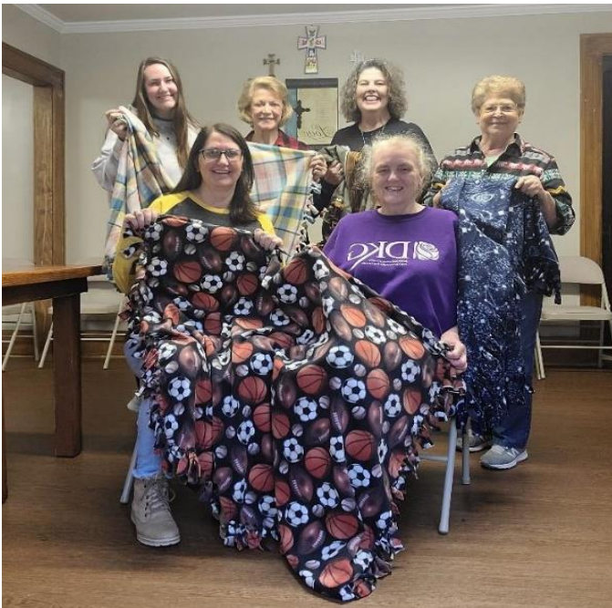
Group D of DKG tie fleece blankets to give to the local Veterans Hospital.